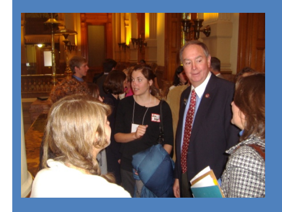
COYAC members meet with legislators at first meet and greet