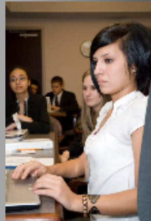
COYAC members meet in procedural committees to conduct Council business

Having established the underlying processes and structures needed to run an effective Council, COYAC enters 2010 with hopes to greatly increase the impact of youth voice in the policy-making process in Colorado. In general terms, the Council is hoping to both respond to existing bills in the short term, and more proactively work with legislators to initiate policy proposals in the future. This will entail creating a new, statewide network of youth and youth-serving organizations in Colorado.