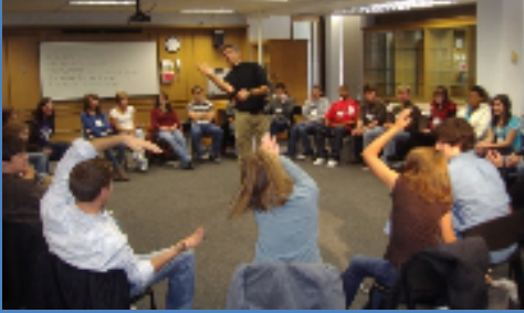
Teambuilding activities at the October kick-off meeting