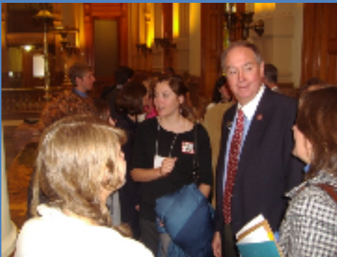
COYAC members meet with legislators at first meet and greet