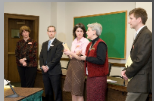
COYAC met with a panel of Legislative Service Staff to learn about the policy making process.