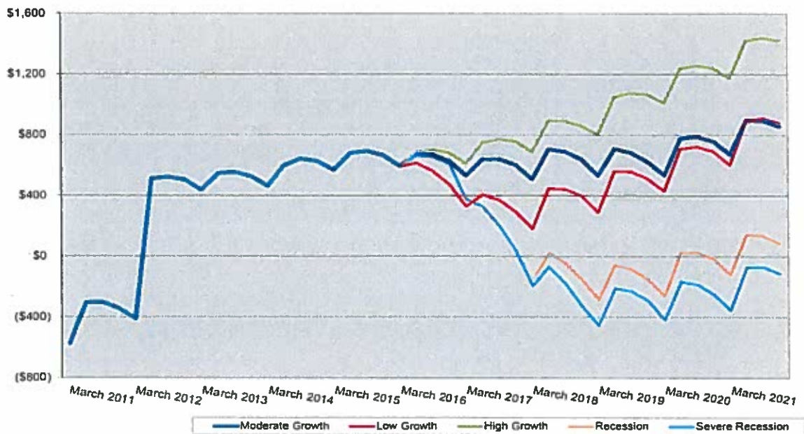
Colorado Unemployment Insurance Trust Fund Balance (Millions) (Forecasts 2016-2021)

The USDOL uses a measure called the average high cost multiple (AHCM) to assess fund solvency. The AHCM estimates how long trust fund reserves can pay benefits at historically high payout rates if one ignores employer premiums that flow into the UITF. The AHCM is measured in years so that an AHCM of 1 means the trust fund has enough reserves to pay benefits for a year at recession levels while an AHCM of 0.5 would mean the fund could pay benefits for six months.