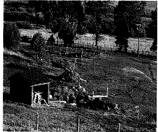
ACRE's Micro-Hydro Project at Elk View Ranch in Archuleta County Completed November 2008