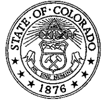
Bill Ritter, Jr. Governor

136 State Capitol Building Denver, Colorado 80203 (303) 866 - 2471 (303) 866 - 2003 fax