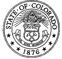
Bill Ritter, Jr. Governor

136 State Capitol Building Denver, Colorado 80203 (303) 866 - 2471 (303) 866 - 2003 fax