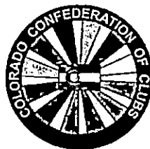
Confederation of Clubs Colorado