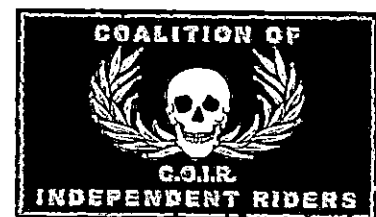
Coalition of Independent Riders Colorado