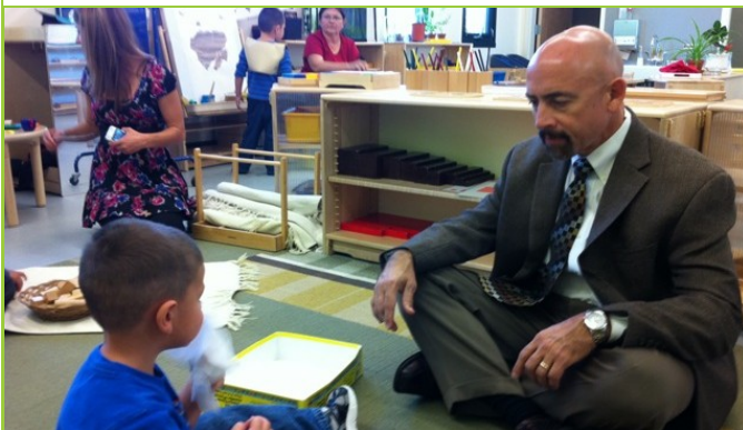
Lieutenant Governor Visits Head Start Classroom. 2011. Photograph. Mile High Montessorri, Denver.

across the system. Users can also forecast the return on investment, or long-term economic benefits , of certain programs. In this way, the cost model will help promote discussions and planning around early childhood policy and funding.