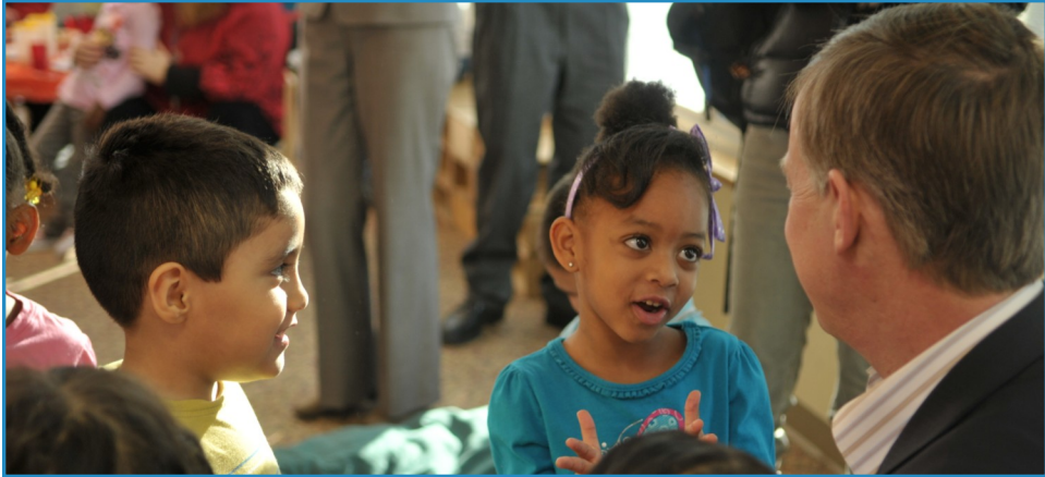
Greeting Children. 2011. Photograph. Clayton Early Learning Center, Denver.

Colorado’s future success and prosperity depends today on the foundation our communities build for every child to thrive.