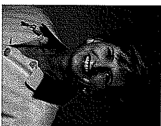
Christine Todd Whitman , Former NJ Governor and EPA Administrator