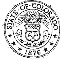
John W. Hickenlooper Governor

To the Honorable Colorado Senate Colorado General Assembly State Capitol Building Denver, CO 80203