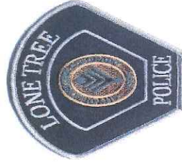
Lonetree Police Department