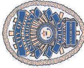
Sheridan Police Department