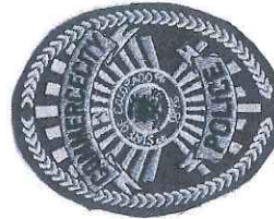
Commerce City Police Department