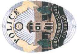
Greenwood Village Police Department