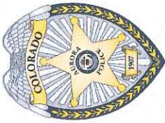
Aurora Police Department