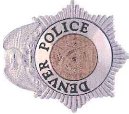
Denver Police Department