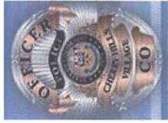
Cherry Hills Village Police Department