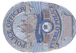
Pueblo Police Department