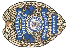
Littleton Police Department