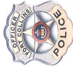
Fort Collins Police Department