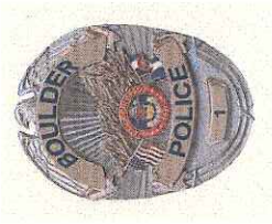
Boulder Police Department