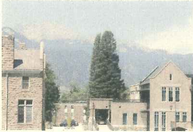
The CSDB campus has 17 buildings located on 37 acres.

The Colorado School for the Deaf and the Blind (CSDB) provides children and families statewide with comprehensive, specialized educational services in safe, nurturing environments. We empower learners to become self-determined, independent, contributing citizens within their communities.