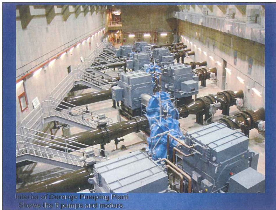
Interior of Durango Pumping Plant Shows the 8 pumps and motors.