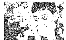
Everything You Need to Know About Cont...