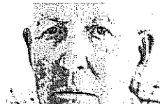
'Warren Buffett Indicator' Signals Coll...