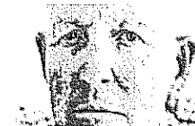
'Warren Buffett Indicator' Signals C...