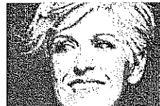
88 Year Old Yoga Teacher Shares Her ...