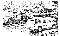
104 car pile up in Denver