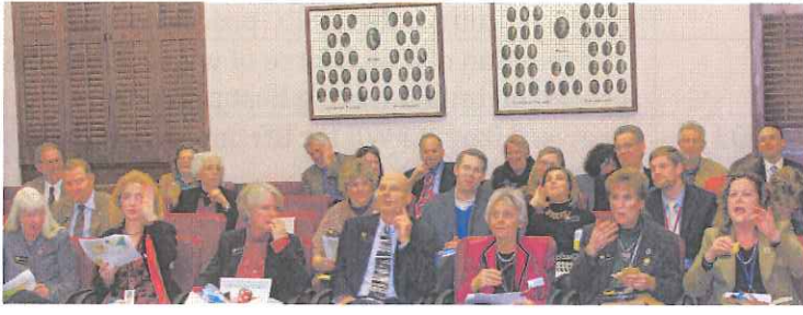
Legislators participate in water trivia at the 2013 Legislative Lunch