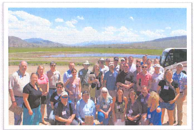
Participants on the 2013 Upper Colorado River Basin Tour

Programs are created with assistance from 300+ supporters through participation on dozens of work groups. Volunteers help with publication review, tour planning, program evaluation, agenda development, and program fundraising and marketing. Their guidance helps CFWE create a set of educational programs that illustrate the diversity of water in Colorado.