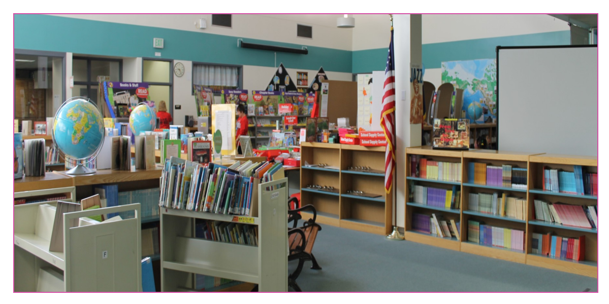
Library. 2011. Photograph. Martinez Elementary, Colorado Springs.