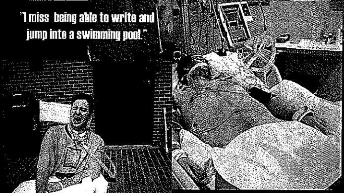
"I miss being able to write and jump into a swimming pool."