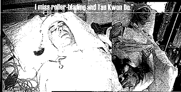
"I miss roller-blading and Tae Kwon Do."