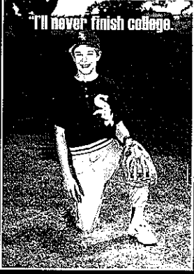
"I'll never finish college."