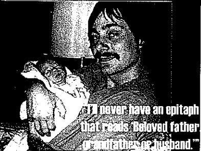
"I'll never have an epitaph that reads 'Beloved father, grandfather, or husband.'"