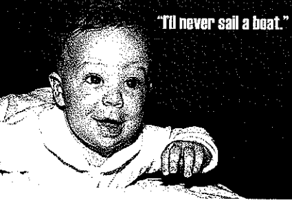
"I'll never sail a boat."