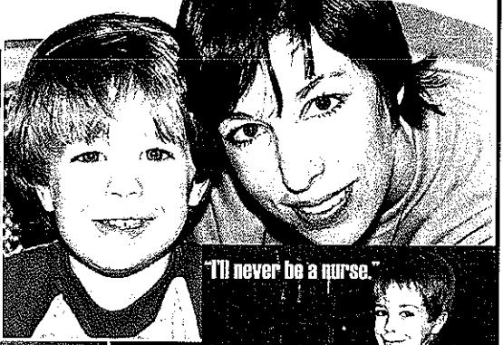
"I'll never be a nurse."