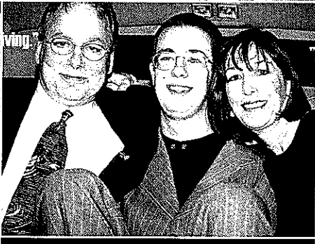
"I miss having a girlfriend."