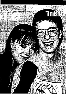
"I miss driving."