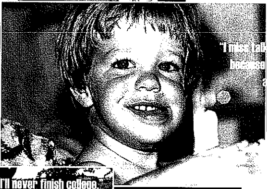
"I miss talking to my friends because I have no friends anymore."