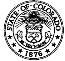
Bill Ritter, Jr. Governor

136 State Capitol Building Denver, Colorado 80203 (303) 866 - 2471 (303) 866 - 2003 fax