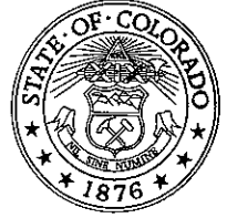
Bill Ritter, Jr. Governor

136 State Capitol Building Denver, Colorado 80203 (303) 866 - 2471 (303) 866 - 2003 fax